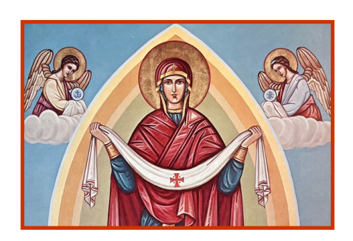
Our Lady of Protection Ukrainian Madonna

We pray for our sisters and brothers in Maui, Morocco, Middle East, and Libya.