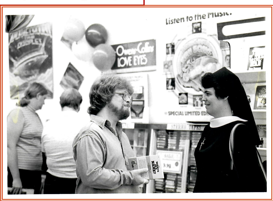
Falls Church, 1970